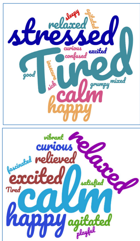
Fig. 4. Word clouds expressing the mood of the participants before (top) and after (bottom) the game.

The trend in the transition from before to after the game stands out as positive for both groups, although in slightly different ways because the starting situation was different. Females showed a pronounced negative state before the game, and used more words than males to describe it. After the game, the mood of females increased significantly (7 different negative words before the game, for a total of 15 recurrences, and only 2 words after the game, each recurring once). While males also showed a decrease in the negative words (from 2 to 1), but in their case it is the positive words that increase in variety (5 different positive words before the game, for a total of 7 recurrences, and 8 words after the game, recurring 10 times). In our estimation, the increase in the variety of words should be regarded as a positive indicator because the richness of the experienced inner state evokes a greater variety of adjectives to describe it. Targeted future studies might address the question whether there is a connection between a session (about 10 minutes) of interacting with an artistic installation (which is expected to stimulate curiosity and creativity) and an (even temporary) increased capacity to feel and to perceive