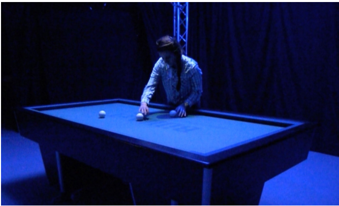
Fig. 1. Participant interacting with BilliArT.

The installation represents a unique case study for scientific investigation because it was specifically designed to be an artistic work as well as a measuring tool . It is a broad idea, but practically it means that the installation allows for an experimental setup to be built around it, by fulfilling a list of requirements: for example, the size of the system must fit in the lab; the duration of the interaction must allow observation without being hours long, and of course the laboratory paraphernalia must not interfere with the artistic experience of the system. In this sense, the close collaboration of the artist has been valuable and necessary. Nobody else can have the authority to judge about the impact that a small decision can have on the desired effect of the installation – unless mandated by the artist himself. Getting the artists personally involved is generally a great asset to the project (Guggenheim 2003), but it's not always possible (for reasons including geographical distance, overbooking, unavailability, lack of interest, untimely passing, etc.). In our case, not only did the artist participate in the experimental design, but helped with the planning of the data collection and analysis thanks to his in-depth knowledge of the technical setup of the installation. For a detailed description of the technical setup, see Vets et al. 2017; in the next Section we present a concise description of how the installation works.